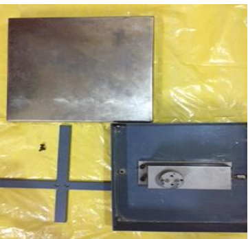
Figure 3 assembly of our flowmeter