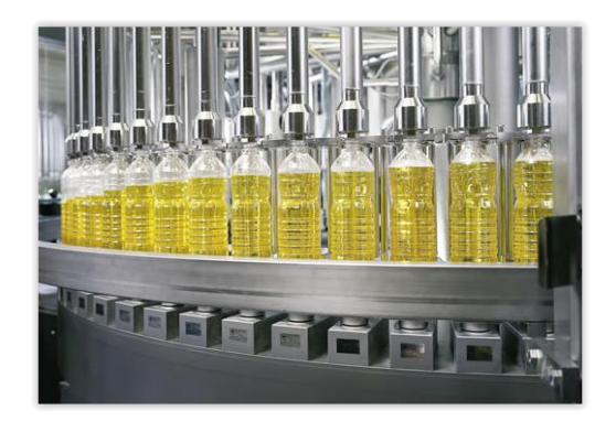
Figure 2 load cell at packaging line