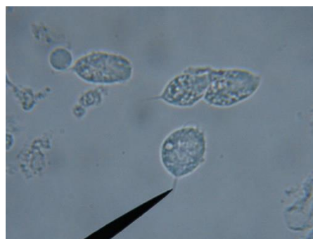
Figure (1): microscopic examination for vaginal discharge show

Trichomoniasis has important medical , social , and economical implication . women who are infected during pregnancy are predisposed to premature rupture of the placental membrane , premature labor and low-birth – weight infants [6] .Complications of this disease are cervical cancer , a typical pelvic inflammatory disease and infertility [7]