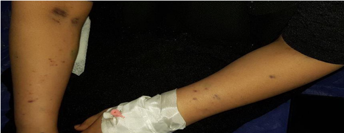
(Figure 10) Petechiae and ecchymosis in COVID-19 patient who developed thrombocytopenia.