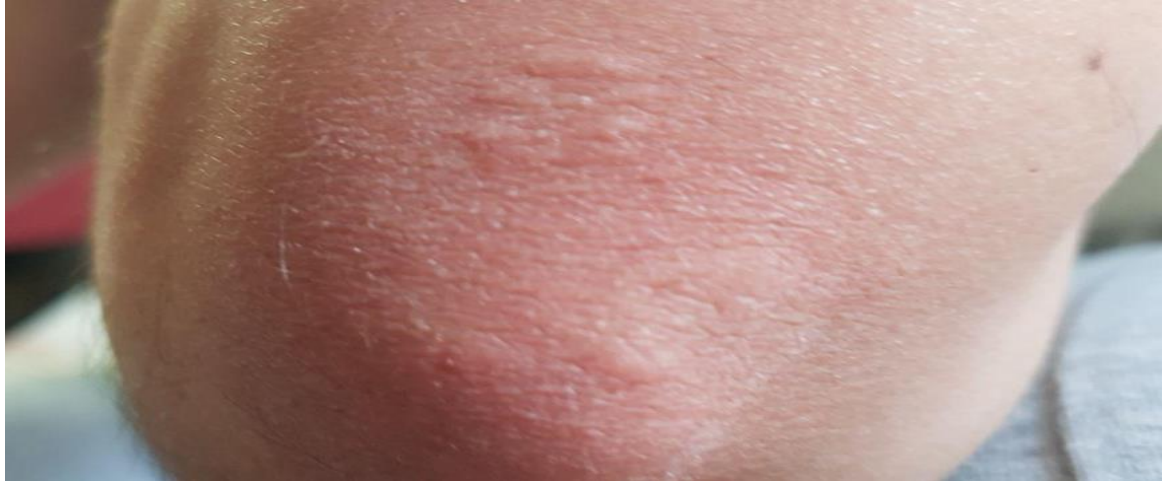
(Figure 11) Granuloma annulare-like presentation in a COVID-19 patient.

To date, we are living at a time of a new virus pandemic that we don't know much about its evolving general manifestations which differ from one country to another including its mucocutaneous ones. This study describes the different morphologies of cutaneous and/or mucosal lesions associated with confirmed COVID-19 adult patients who had been admitted to the quarantine hospital in Al- Nasiriyah city, south of Iraq. Four main clinical patterns were observed; maculopapular, urticarial, pustular and papulovesicular and vasculitic lesions, in addition to a fifth group of miscellaneous cases of one or two patients who manifested distinct cutaneous lesions. Some of these patterns have been reported in previous studies [5] with larger sample size, but in contrast to this study they included the suspected and close contact cases in addition to the confirmed cases of COVID-19, this might explain