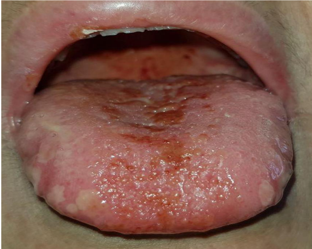
(Figure 4) Pustules affecting the mouth which are evident on the side of the tongue.