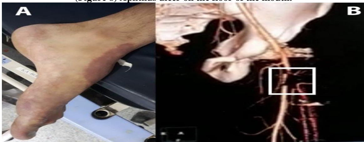
(Figure 9) Unilateral acute limb ischemia: (A) clinical and (B) CT-angiographic pictures with the rectangle highlighting the site of arterial obstruction.