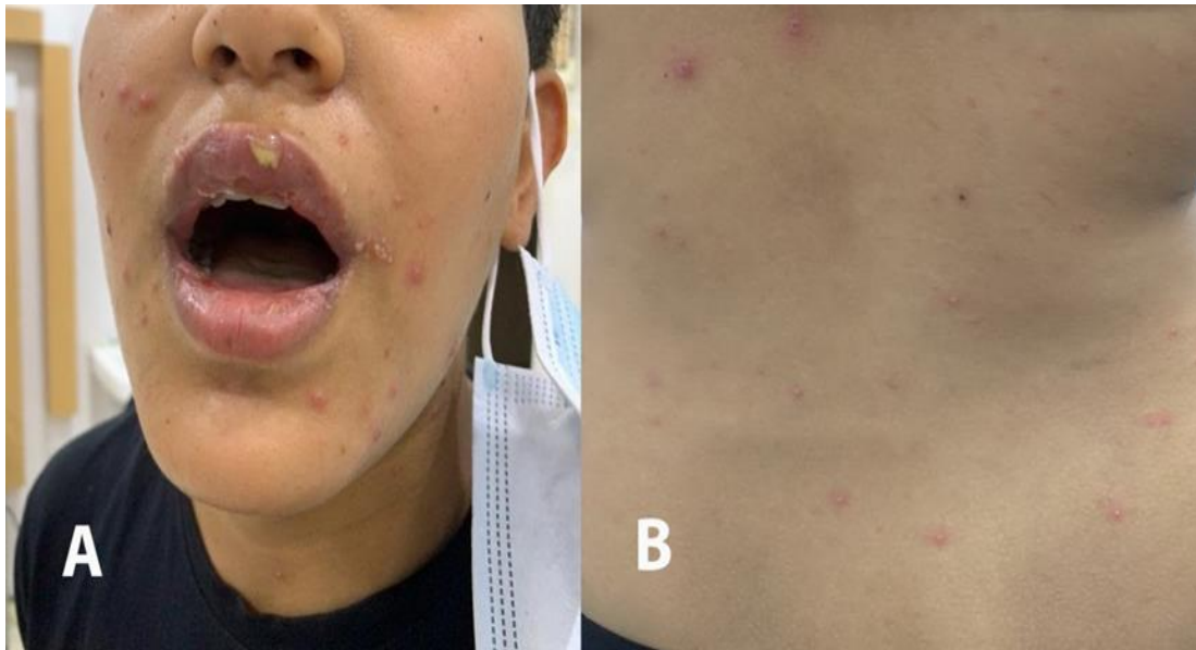
(Figure 5) Papulovesicles and pustules (A) affecting the face with evident fluid level on the upper lip, (B) the back of the same patient.