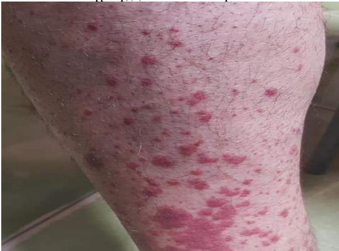
(Figure 6) Palpable purpura affecting the lower leg.