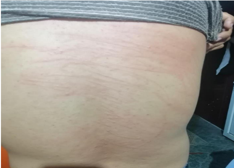
(Figure 3) Dermographism in COVID-19 patient.