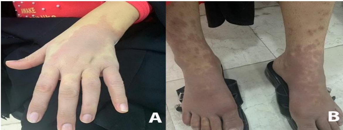
(Figure 7) Dusky erythema and edema (A) the hand and (B) the feet of the same patient.