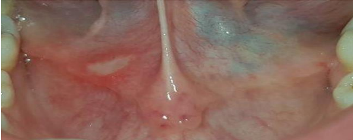
(Figure 8) Aphthous ulcer on the floor of the mouth.