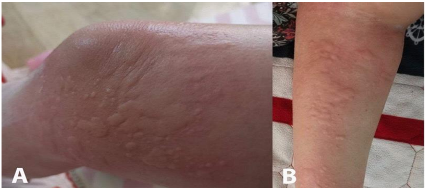
(Figure 2) Wheals on the leg (A) and the arm (B) of a young COVID-19 patient.