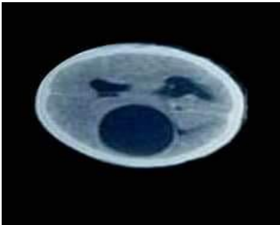
FIG .1: computed tomography ( CT ) scan showing a very large the right temporo - parietal region of the patient. The cyst is well demarcated , isodense with cerebrospinal fluid ,and causing marked mass effect.