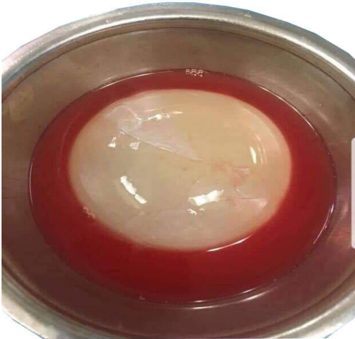
FIG .2: Intraoperative picture showing the exposed hydrated cyst (a),and totally removed cyst without rupture(b).