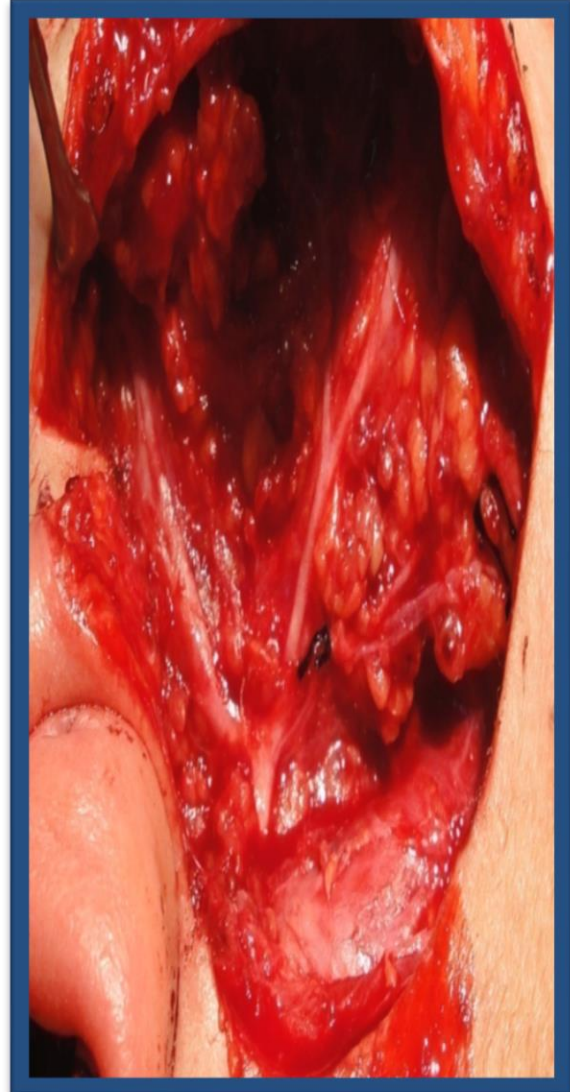
Fig. 2.4 The Facial nerve