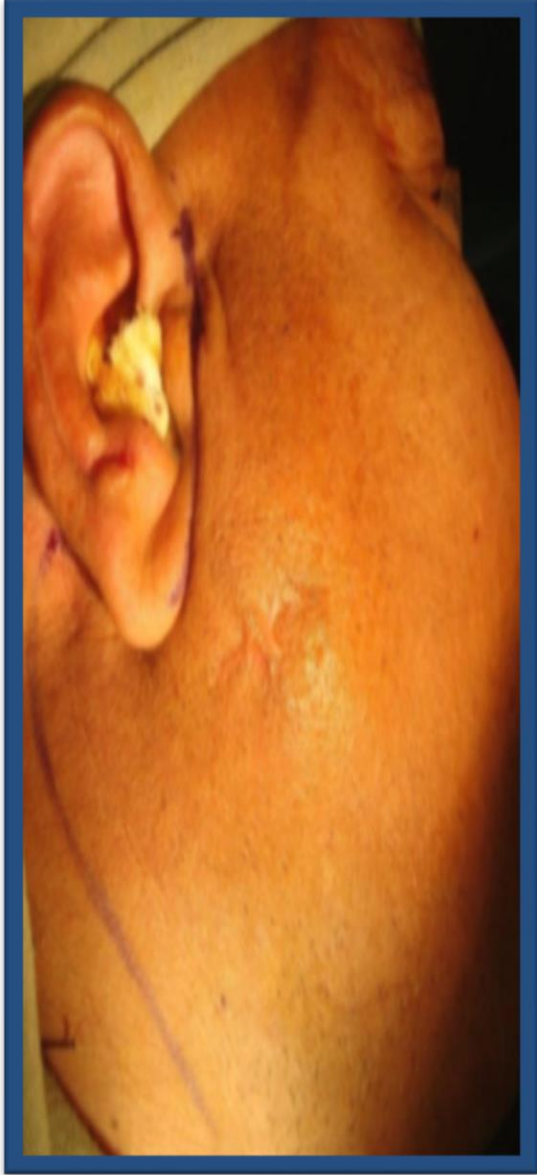
Fig. 2.1 Blair incision