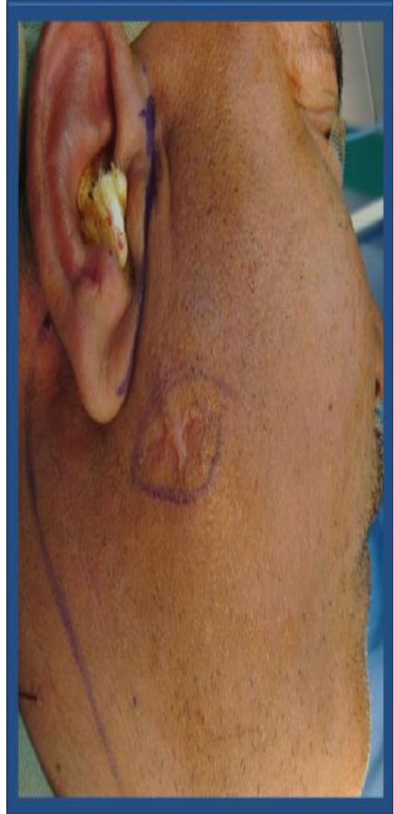
Fig. 2.2 Blair incision with excision of scar from previous incisional biopsy