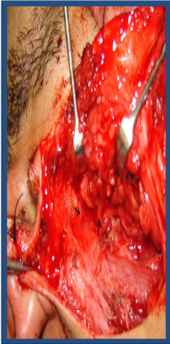
Fig. 2.3 The Tragal pointer and facial nerve